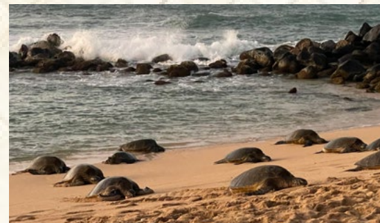
{Honu, the Hawaiian Green Sea Turtle}