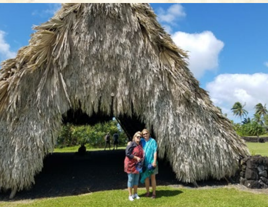
{Visit a wahi pana (sacred site) with traditional protocol}

I have a love and deep knowledge of the islands, and I like to share those less-traveled places and special sacred sites with their colorful stories, legends and history with my guests, which I have been doing since 1983. I hold a Master's degree in Education, and I have had decades of authentic study, teaching, and guiding experiences in Hawaiian cultural immersion.